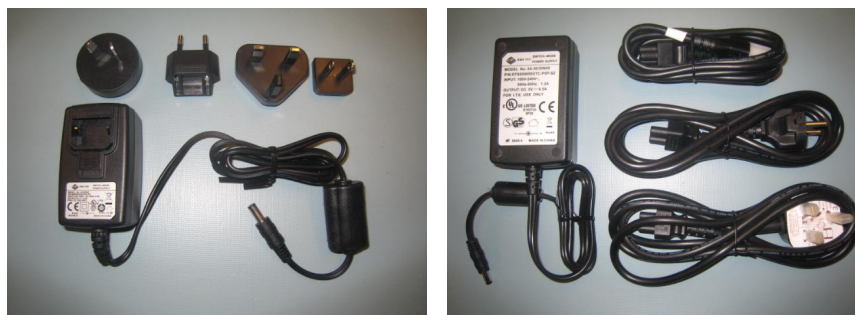
Figure 2: Example New compatible power supply solution (May not represent exact configuration in all cases)