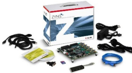
Xilinx Zynq-7000 All Programmable SoC ZC702 Evaluation Kit