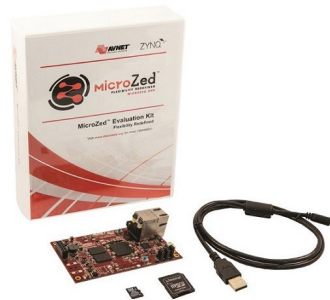
Avnet MicroZed™ Evaluation Kit