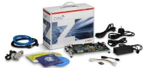
Xilinx Zynq-7000 All Programmable SoC ZC706 Evaluation Kit