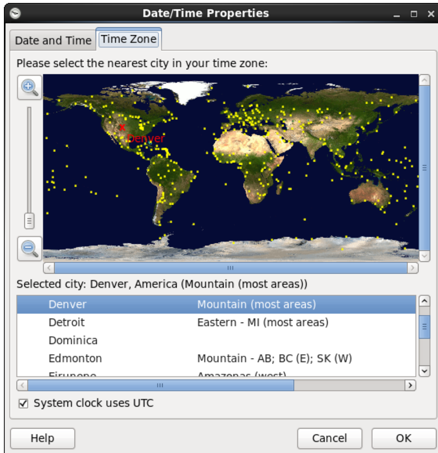
Figure 4-2: Date/Time Properties Dialog Box

The Date/Time Properties dialog box opens.