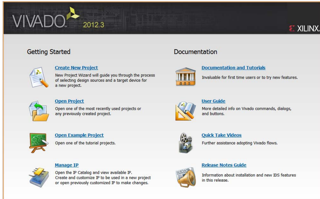
Figure 3-2: The Getting Started Page