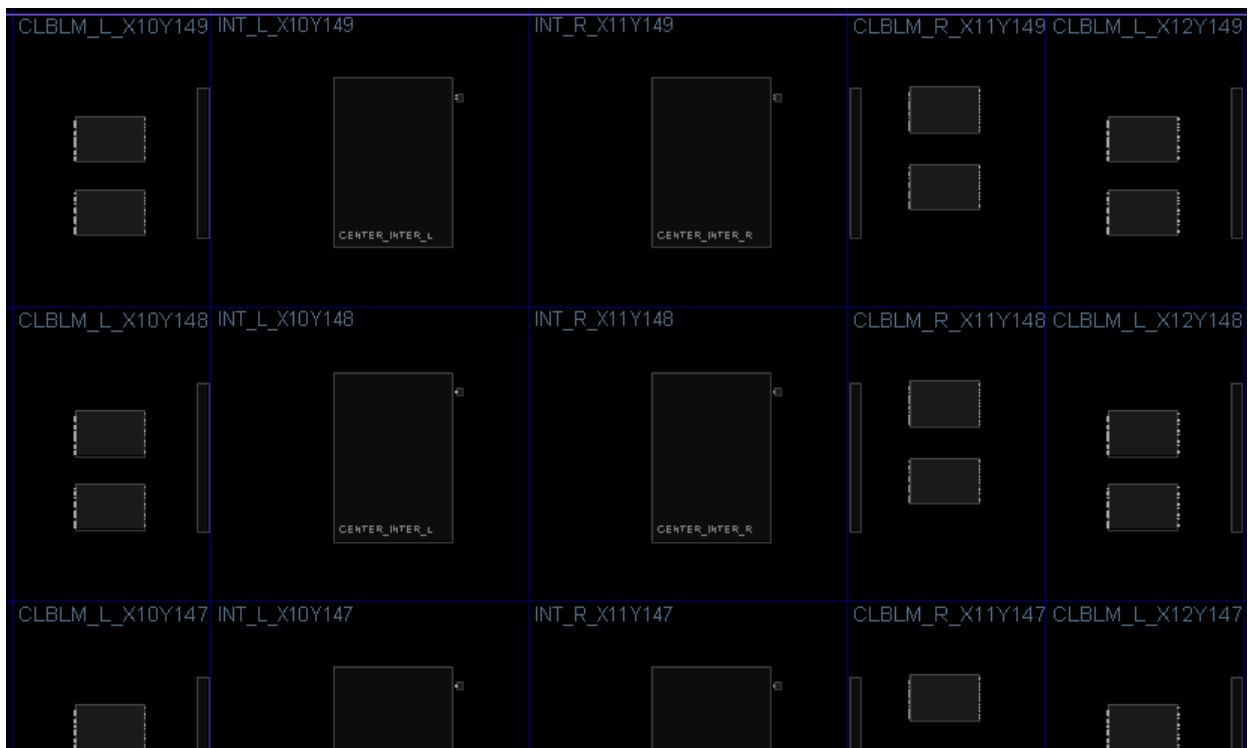
Figure 1: INT Tile Locations

When you zoom in, you'll see INT locations as shown in Figure 1 (routing resources are hidden to simplify this image):